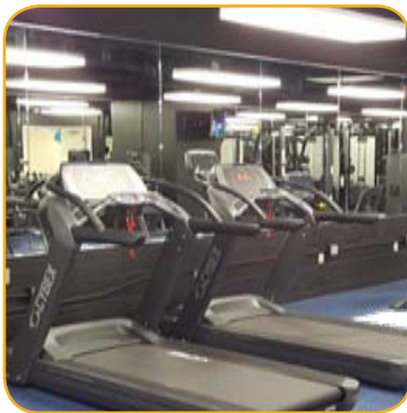
170 N. Main

The City of Memphis offers FREE access to Fitness Centers at Community Centers. Most centers are equipped with weights, power rowers, elliptical machines, treadmills, stair climbers, and much more! Contact Wellness@memphistn.gov or call the Wellness Coordinator at 901-636-6574 for additional information.